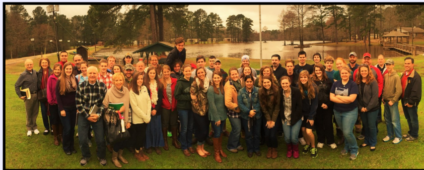
Southland Christian Camp in Ringgold, Louisiana